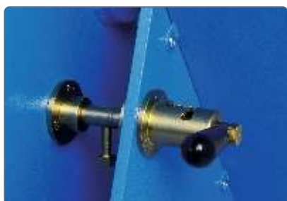
Drum Position Lock with Safety Switch