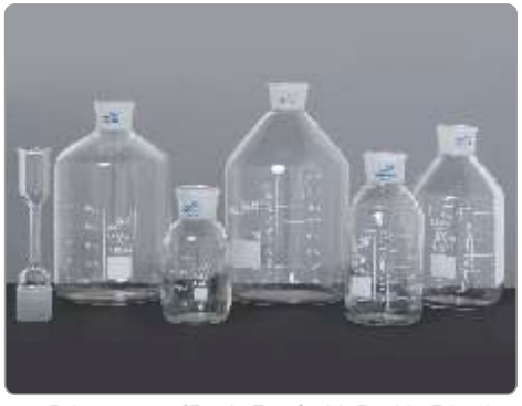
Pyknometers (Bottle Type) with Double Edged and Capillary Tubed Funnel