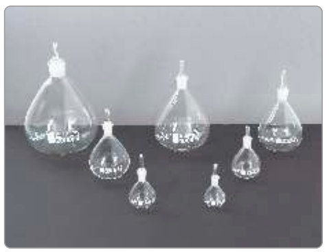
Pyknometers (Specific Gravity Bottles)