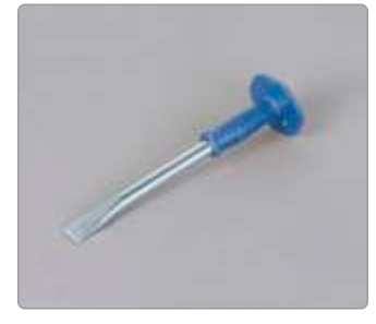
Chisel Flat Ended