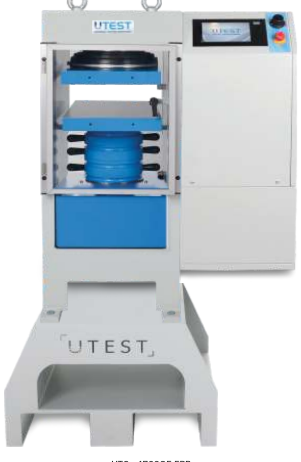
UTC - 4729GE.FPR

UTC-4680 and UTC-4682 Pedestals that are made of steel to facilitate the user's placement of specimens in the frames for compression test should be ordered separately.